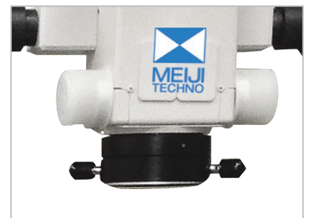
Continuous zoom by drum rotation